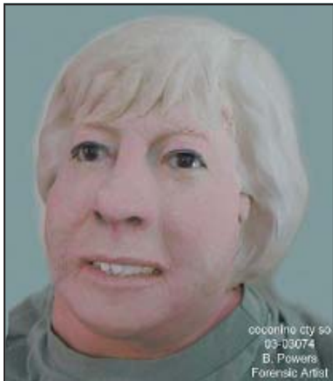
Unidentified Homicide Victim

O n October 24, 2003, deer hunters found the body of a woman lying face down in a wooded area off Devil Dog Road about 1 mile south of Interstate 40 and 6 miles west of Williams, Arizona. This area is a popular entrance into the Grand Canyon National Park. The victim died from a single blow to her head and likely was killed someplace other than where her body was discovered. All attempts to identify this female have been unsuccessful.