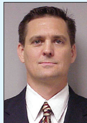
Special Agent Hoover is a supervisor in the DEA's Sacramento, California, office.

“ Messages bombard people all day every day; a strategically delivered one will resonate better with employees. ”