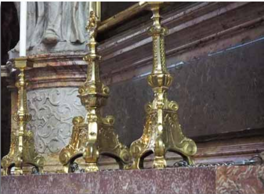
Chained altar pieces demonstrate the threat of theft in houses of worship.

After it was founded in 1969 as a philatelic squad (investigating stamp thieves) and later disbanded, Scotland Yard's Arts and Antiques Unit was restructured in 1989. The unit has seen remarkable success as museum theft in London has gone down by more than 60 percent in recent years, with an average annual recovery of £7 million ($11.3 million) worth of stolen art. 14 This follows on the unit's primary engagement with breaking up art forgery and con artist rings. The unit also runs the London Stolen Art Database (LSAD), which includes over