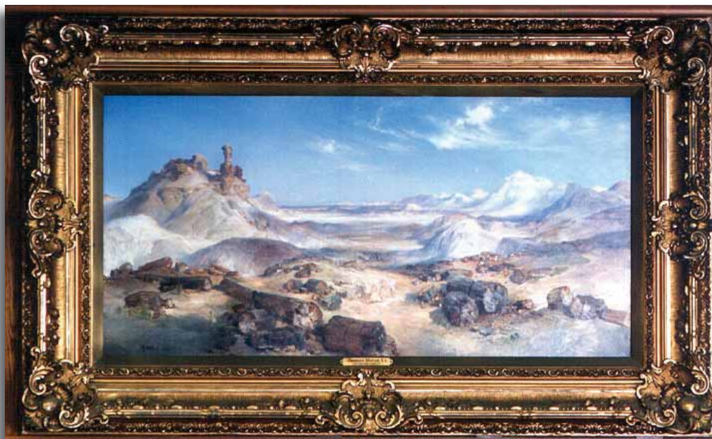
Works by noted artists—for example, Thomas Moran—have substantial financial and historic significance.

local community. Thefts of such items for personal collections or conversion to cash have a local, if not national, impact. 20