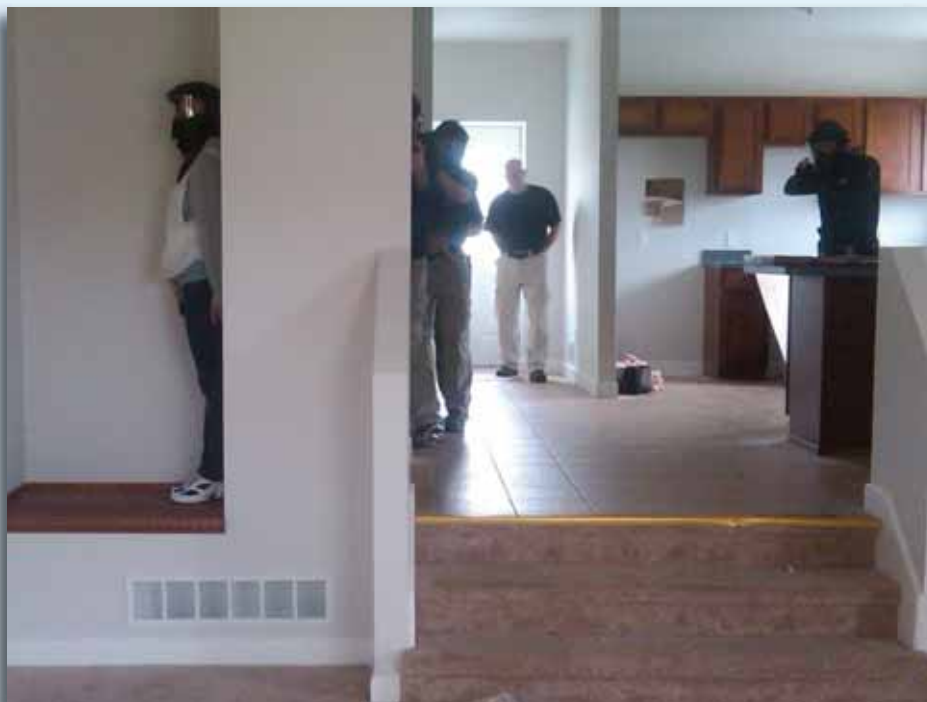
Students move toward the living room while an instructor watches. The house presents multiple danger areas for students to address even though there is no furniture.